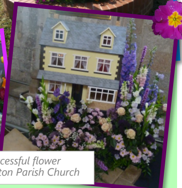
Another successful flower festival at Credition Parish Church