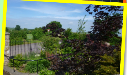
All the wildlife friendly trees at Upper Deck